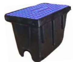
Tapered Box Range