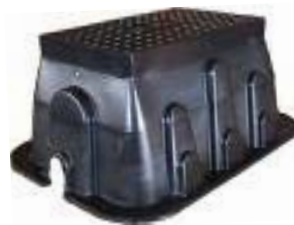
Jumbo Box Range