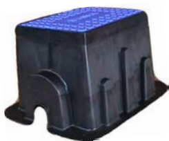
Midi Box Range

The base provides a firm seating for the cover and inter connecting pipe without impinging on the valve or service pipe.